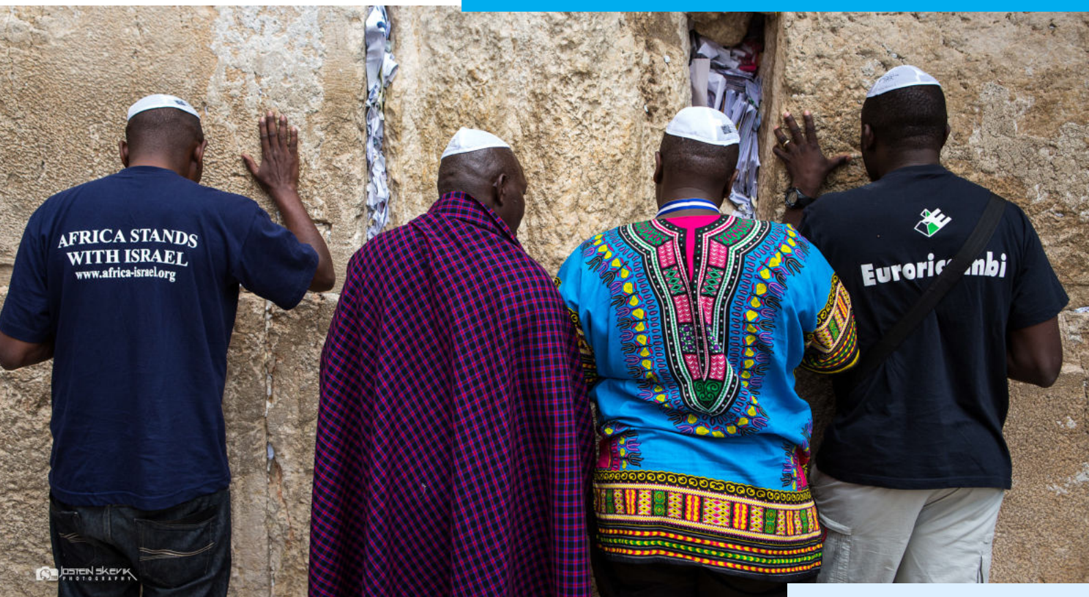
Western wall - Africans praying.

Psa 133:3 As the dew of Hermon, and as the dew that descended upon the mountains of Zion: for there the LORD commanded the blessing, even life for evermore.