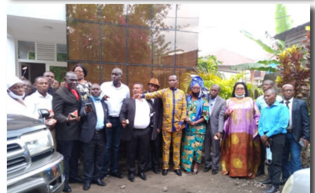
Goma DRC Congo team with All President & All Admin Director.